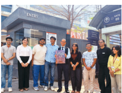
Threads of Hope